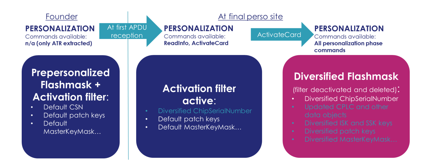
Figure 4: Delivery flow with the diversification filter mechanism

Note: Transport is secured using OS authentication. Else, the transition between "ACTIVATION PENDING" and "PERSONALIZATION" is irreversible.