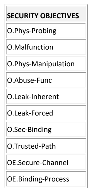
Table 5 Security Objectives and OSPs - Coverage