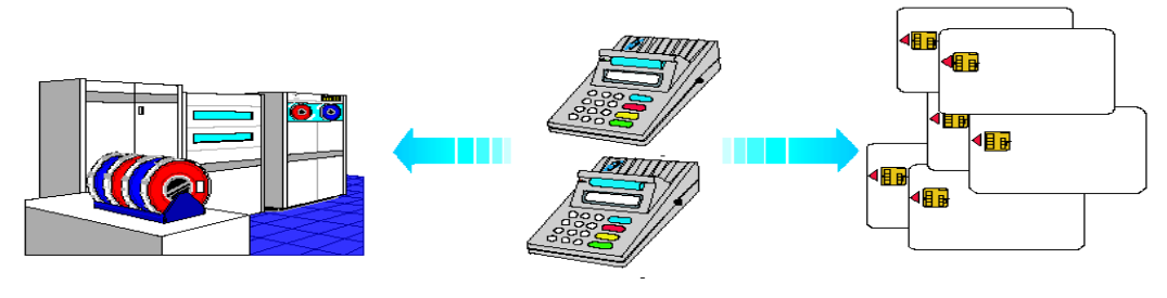
Figure 1. TOE's environment

The interface of the TOE to the outside world is over a smart card reader or access device such as POS (Point of Sale) machine. PC (over the smart card reader) or access device transmits the commands to the smart card. Incoming commands are interpreted by TOE and the response is transmitted back to the access device or to the PC over smart card reader (Figure 1).