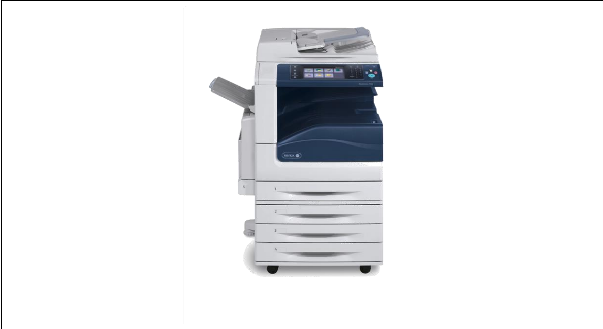
Figure 1: Xerox® WorkCentre® 7970/7970i 2016 Xerox® ConnectKey® Technology

The TOE can integrate with an IPv4 network with native support for DHCP. The hardware included in the TOE is shown in the figure below.