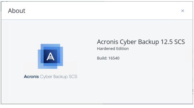
Figure 2 – Querying Current Version of Application Software

The TOE provides the ability to query the current version of the application software by clicking the question mark icon in the top-right corner and then About . A page pops-up displaying the current version and build number of the TOE as shown in Figure 2.