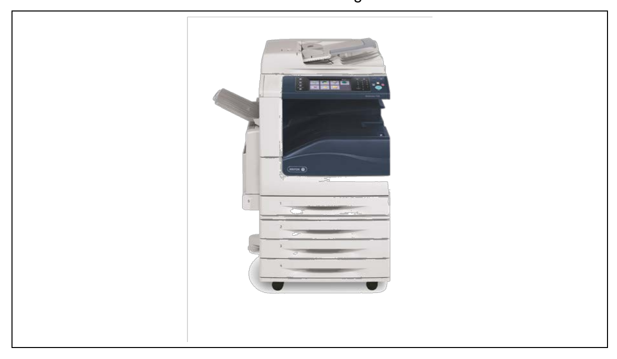
Figure 1: WorkCentre® 7830/7835 Xerox® ConnectKey® Technology with SIPRNet Support

The TOE can integrate with an IPv4 network with native support for DHCP. The hardware included in the TOE is shown in the figure below.