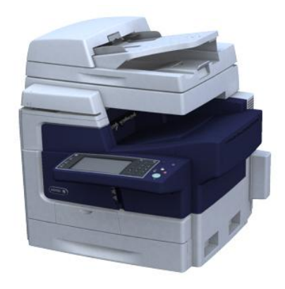
Figure 1: Xerox ColorQube<sup>™</sup> 8700/8900

The various software and firmware that comprise the TOE are listed in Table 2. A system administrator can ensure that they have a TOE by printing a configuration sheet and comparing the version numbers reported on the sheet to the table below.