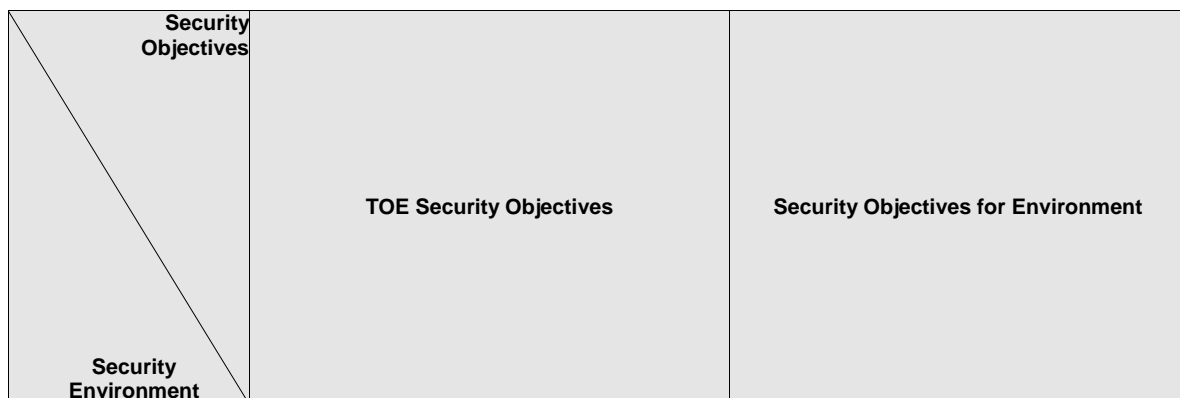
(Table 20) Mapping between Security Environments and Security Objectives

(Table 20) shows the mapping between security environments and security objectives.