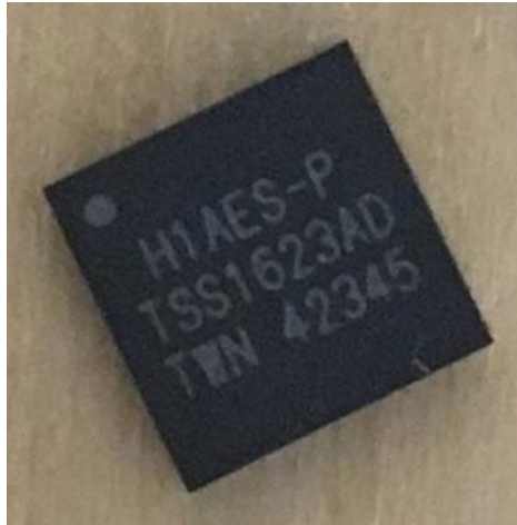
Figure 1- GSC Chip Physical Boundary (Front)

The cryptographic boundary is the outer perimeter of the chip shown in the below figure. The physical embodiment is a single-chip module as defined by FIPS 140-2. The hardware version of the GSC chip is H1B2P.