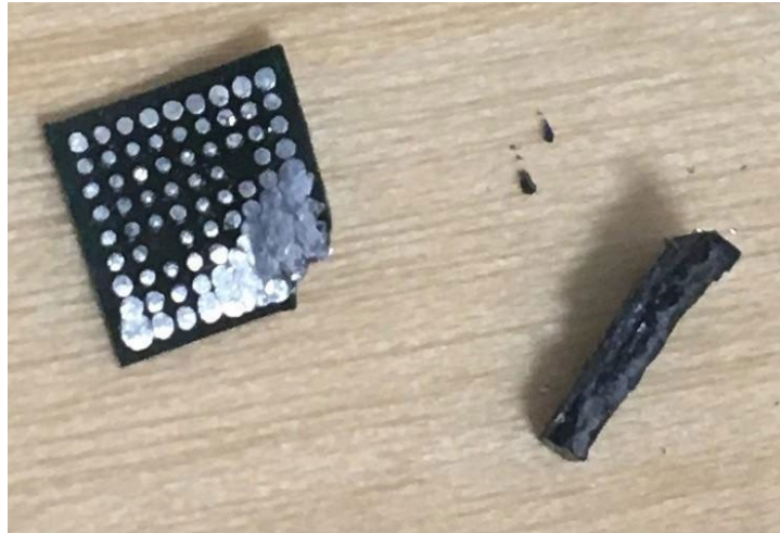
Figure 4- Tamper Evidence and damage to the module

The module hardness testing was performed at a single ambient temperature of 72 °F. No assurance is provided for Level 3 hardness conformance at any other temperatures.