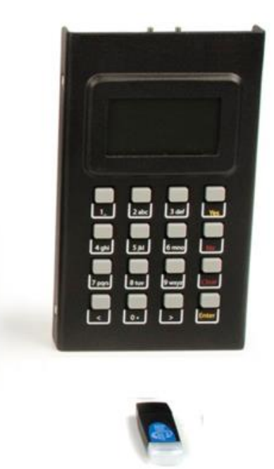
Figure 2: Thales Luna PED and Provider Domain Administrator (PDA) iKey

> Blue (HSM) iKey – for the storage of PDA authentication data<sup>1</sup>.