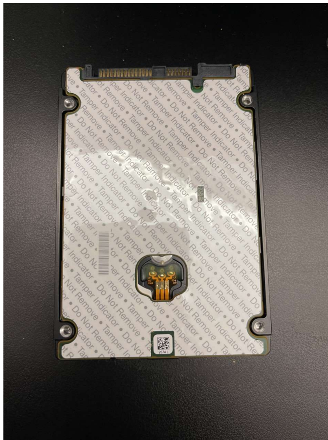
Figure 1: Exos 7E2000 (SAS Interface)