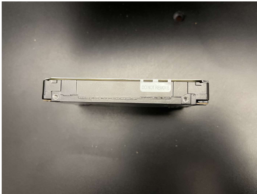
Figure 5: Exos 7E2000 (SAS Interface) security label on side of drive