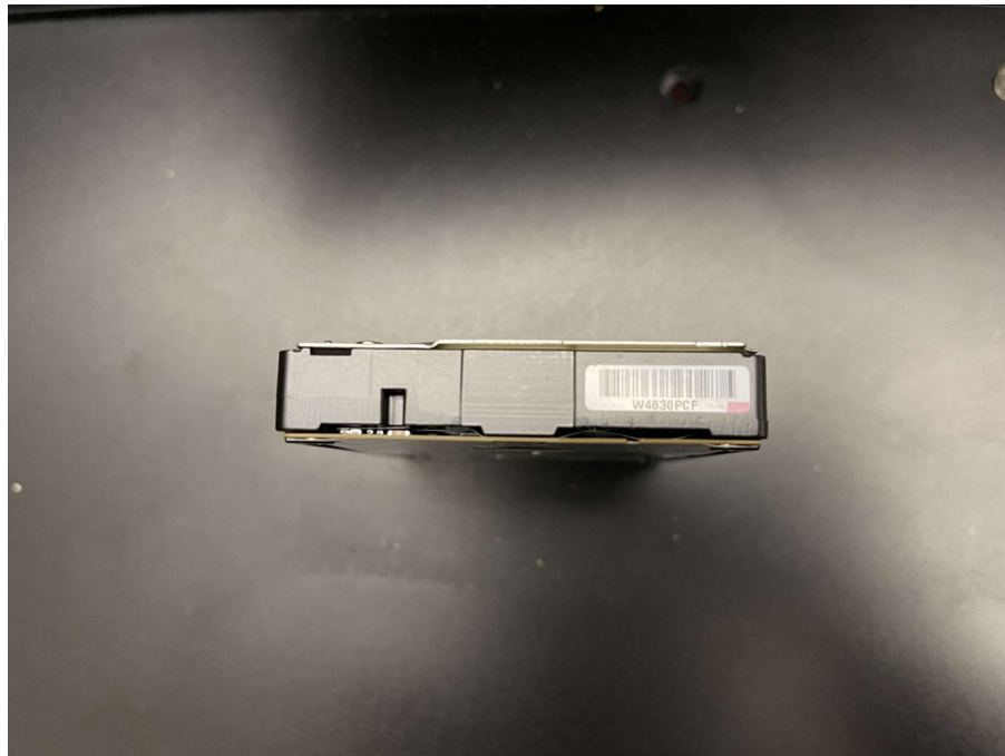
Figure 3: Exos 7E2000 (SAS Interface) Bottom