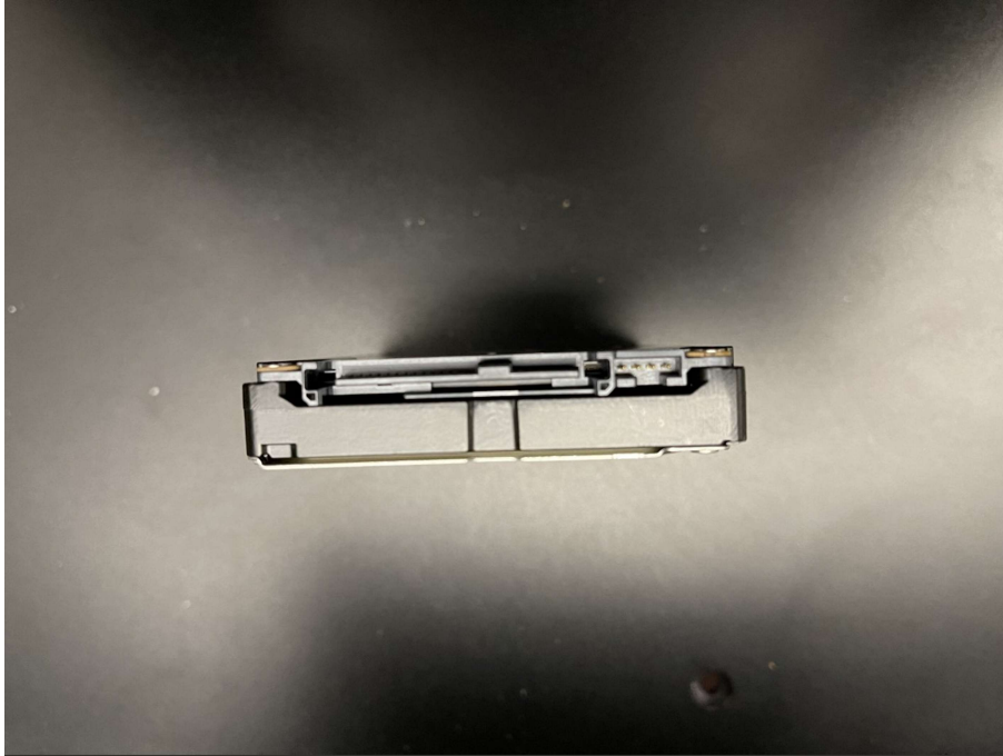
Figure 2: Exos 7E2000 (SAS Interface)