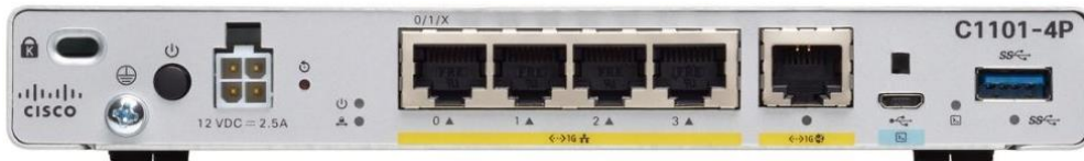
Figure 1: ISR 1101

The Cisco 1100 Series ISRs are well suited for deployment as Customer Premises Equipment (CPE) in enterprise branch offices, in service provider managed environments as well as smaller form factor and M2M use cases.