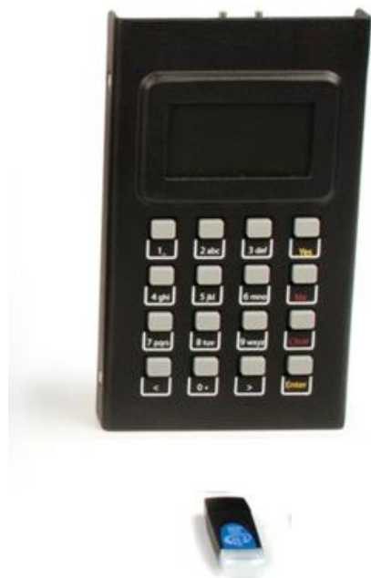
Figure 2: Thales Luna PED and Provider Domain Administrator (PDA) iKey