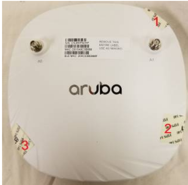
Figure 20 – Top View of AP-504 with TELs

The AP-504 requires 4 TELs: one on each side edge (labels 1, 2 and 3) to detect opening the device and one covering the console port (label 4) to detect access to a restricted port. See figures 20 and 21 for placement.