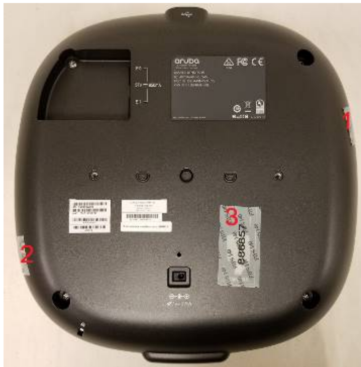
Figure 31 – Bottom View of Aruba AP-535 with TELS