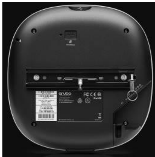
Figure 7 - Aruba AP-514 Campus Access Point – Back