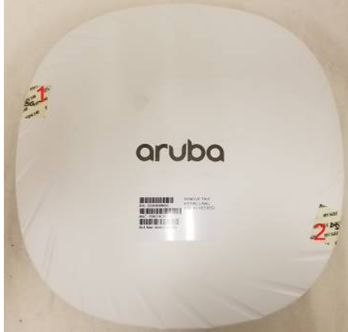
Figure 30 – Top View of AP-535 with TELS

The AP-535 requires 3 TELS: one on each side edge (labels 1 and 2) to detect opening the device and one covering the console port (label 3) to detect access to a restricted port. See figures 30 and 31 for placement.