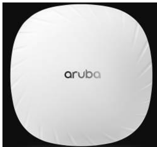
Figure 13 - Aruba AP-535 Campus Access Point – Front