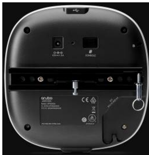
Figure 2 - Aruba AP-504 Campus Access Point – Back