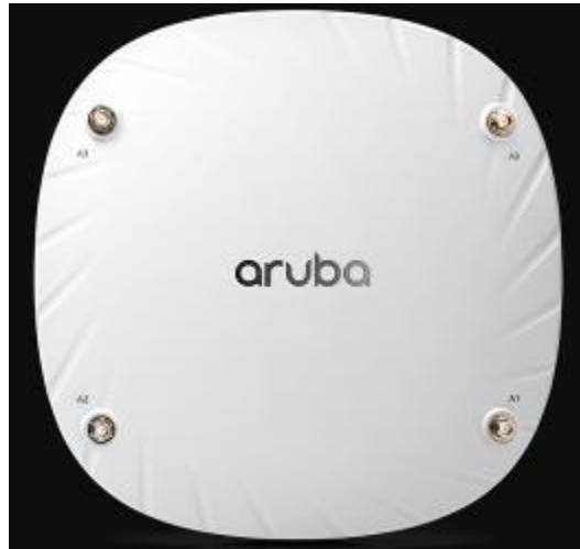
Figure 6 - Aruba AP-514 Campus Access Point – Front

This section introduces the Aruba AP-510 Series Campus Access Points (APs) with FIPS 140-2 Level 2 validation. It describes the purpose of the AP-514 and AP-515 APs, their physical attributes, and their interfaces.