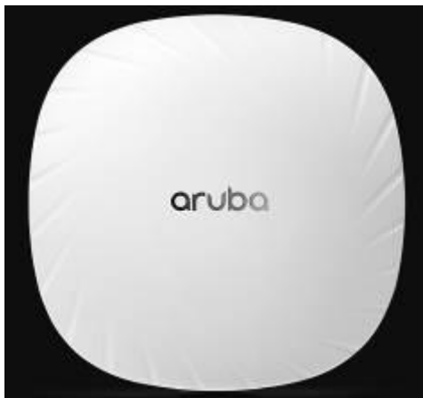
Figure 16 - Aruba AP-555 Campus Access Point – Front

This section introduces the Aruba AP-550 Series Campus Access Points (APs) with FIPS 140-2 Level 2 validation. It describes the purpose of the AP-555 APs, their physical attributes, and their interfaces.