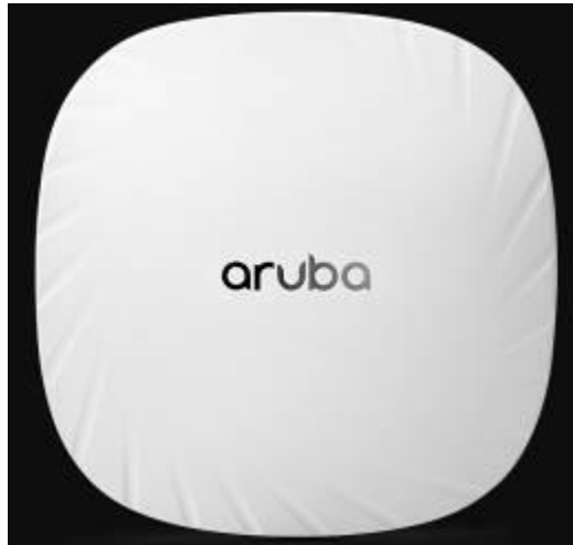
Figure 3 - Aruba AP-505 Campus Access Point – Front