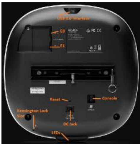
Figure 15 - Aruba AP-530 Series Campus Access Point – Interfaces