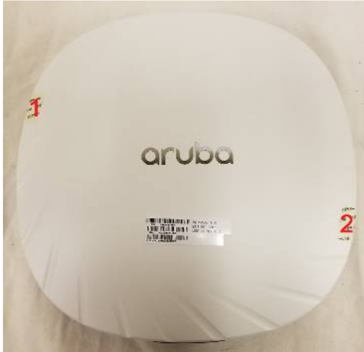
Figure 32 – Top View of AP-555 with TELS

The AP-555 requires 3 TELS: one on each side edge (labels 1 and 2) to detect opening the device and one covering the console port (label 3) to detect access to a restricted port. See figures 32 and 33 for placement.