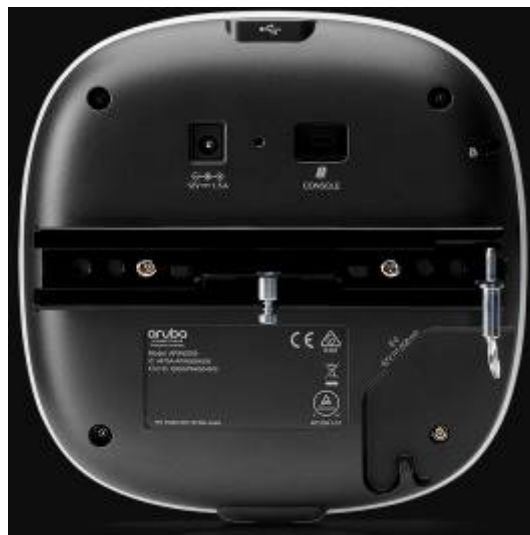
Figure 4 - Aruba AP-505 Campus Access Point – Back