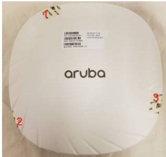
Figure 26 – Top View of AP-515 with TELs

The AP-515 requires 4 TELs: one on each side edge (labels 1, 2 and 3) to detect opening the device and one covering the console port (label 4) to detect access to a restricted port. See figures 26 and 27 for placement.