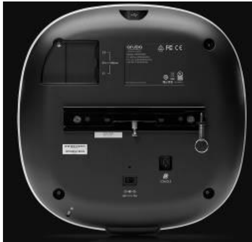
Figure 14 - Aruba AP-535 Campus Access Point – Back

With a maximum concurrent data rate of 2.4 Gbps in the 5 GHz band and 1,150 Mbps in the 2.4 GHz band (for an aggregate peak data rate of 3.55 Gbps), the 530 Series Access Points deliver high performance 802.11ax access for mobile and IoT devices in indoor environments for any enterprise environment. The high performance and high density 802.11ax 530 Series Access Points support all mandatory and several optional 802.11ax features, which include up- and downlink Orthogonal Frequency Division Multiple Access (OFDMA) with up to 37 resource units for increased user data rates and reduced latency, up- and downlink Multi-User Multiple Input Multiple Output (MU-MIMO) for improved network capacity with multiples devices capable to transmit simultaneously, 4x4 MIMO with up to four spatial streams (4SS) in both the 5 GHz and 2.4 GHz bands, channel bandwidths up to 160 MHz (in 5 GHz; 40 MHz in 2.4 GHz), and up to 1024-QAM modulation. Each AP supports up to 1,024 associated client devices per radio and has a total of four dual band antennas. In addition to 802.11ax standard capabilities, the Wi-Fi 6 530 Series supports unique features like Aruba ClientMatch radio management and additional radios (Bluetooth 5 and Zigbee) for location services, asset tracking services, security solutions and IoT sensors, as well as ArubaOS 8 features like Aruba Activate and AirMatch with machine learning technology to automatically optimize the wireless network performance.