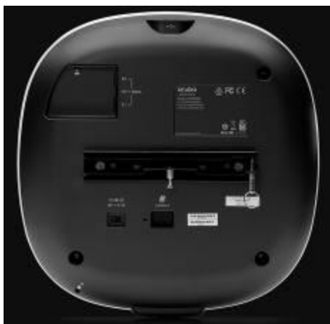
Figure 17 - Aruba AP-555 Campus Access Point – Back