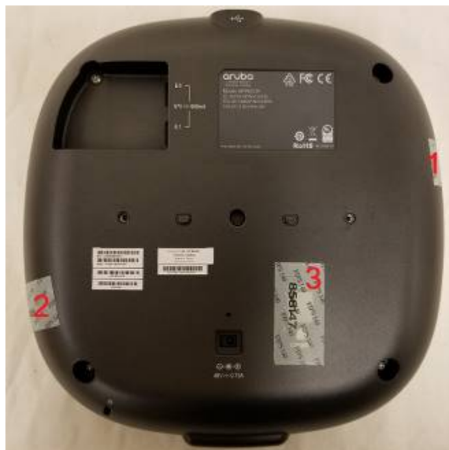
Figure 29 – Bottom View of Aruba AP-534 with TELS