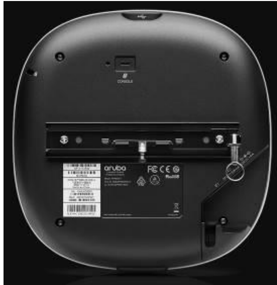
Figure 9 - Aruba AP-515 Campus Access Point – Back