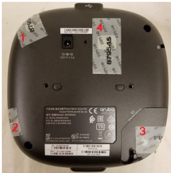
Figure 21 – Bottom View of AP-504 with TELs