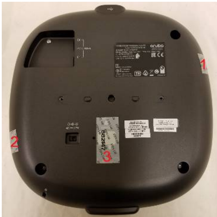
Figure 33 – Bottom View of Aruba AP-555 with TELS