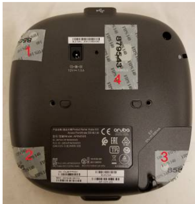
Figure 23 – Bottom View of Aruba AP-505 with TELs