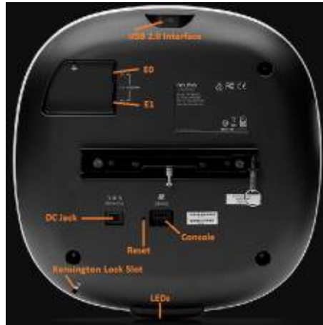
Figure 18 - Aruba AP-550 Series Campus Access Point – Interfaces