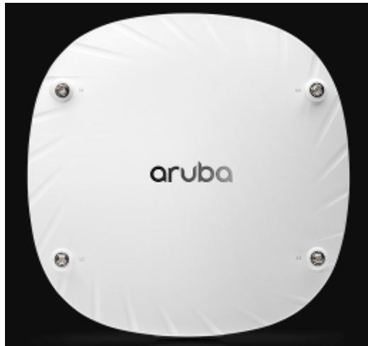
Figure 11 - Aruba AP-534 Campus Access Point – Front

This section introduces the Aruba AP-530 Series Campus Access Points (APs) with FIPS 140-2 Level 2 validation. It describes the purpose of the AP-534 and AP-535 APs, their physical attributes, and their interfaces.