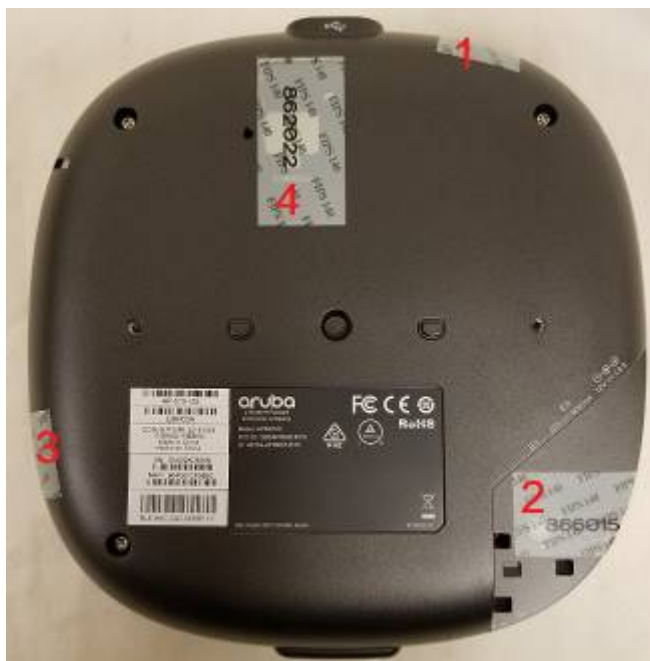
Figure 27 – Bottom View of Aruba AP-515 with TELs