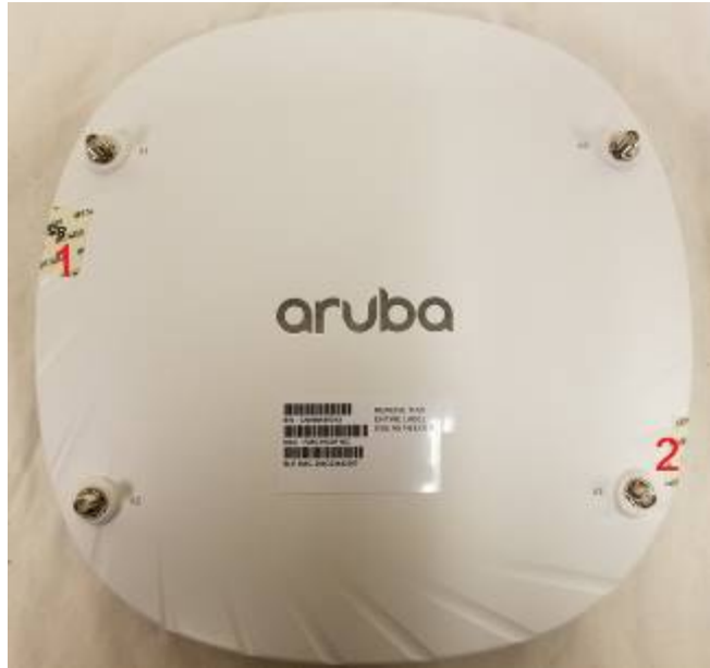
Figure 28 – Top View of AP-534 with TELS

The AP-534 requires 3 TELS: one on each side edge (labels 1 and 2) to detect opening the device and one covering the console port (label 3) to detect access to a restricted port. See figures 28 and 29 for placement.