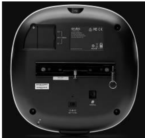
Figure 12 - Aruba AP-534 Campus Access Point – Back