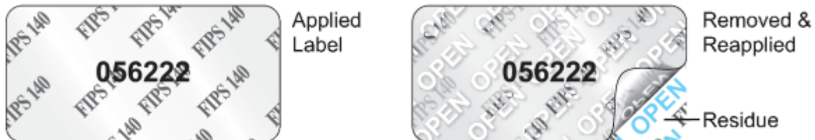
Figure 19 - Tamper-Evident Labels

Once applied, the TEs included with the Wireless Access Point cannot be surreptitiously broken, removed, or reapplied without an obvious change in appearance: