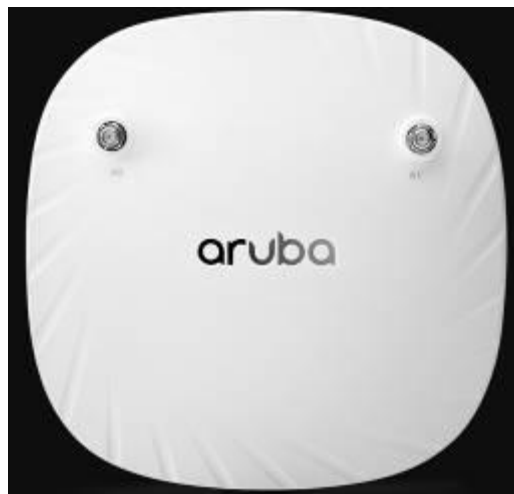
Figure 1 - Aruba AP-504 Campus Access Point – Front

This section introduces the Aruba AP-500 Series Campus Access Points (APs) with FIPS 140-2 Level 2 validation. It describes the purpose of the AP-504 and AP-505 APs, their physical attributes, and their interfaces.