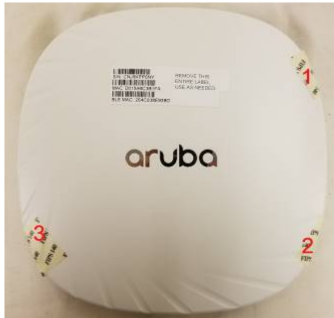
Figure 22 – Top View of AP-505 with TELs

The AP-505 requires 4 TELs: one on each side edge (labels 1, 2 and 3) to detect opening the device and one covering the console port (label 4) to detect access to a restricted port. See figures 22 and 23 for placement.