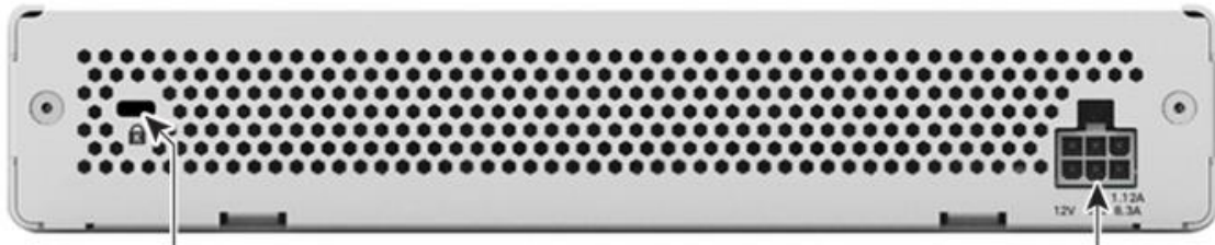
Figure 6: Back Cisco Catalyst 9800-L