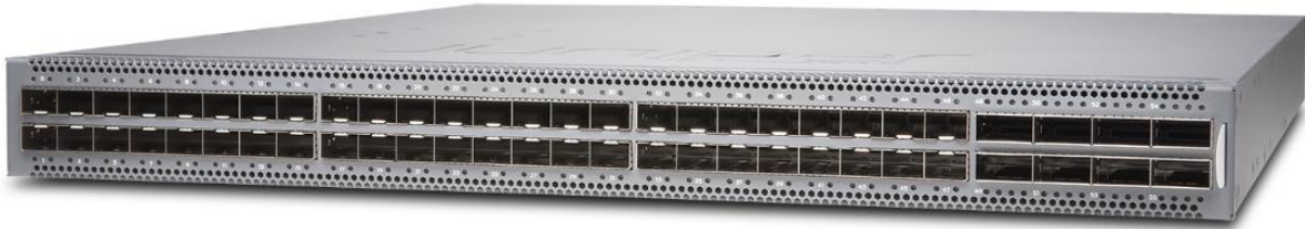
Figure 9 - EX 4650-48Y front view