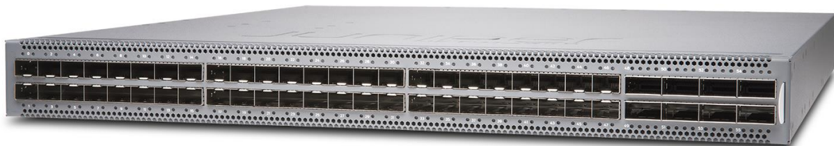
Figure 3 - QFX 5120-48Y front view