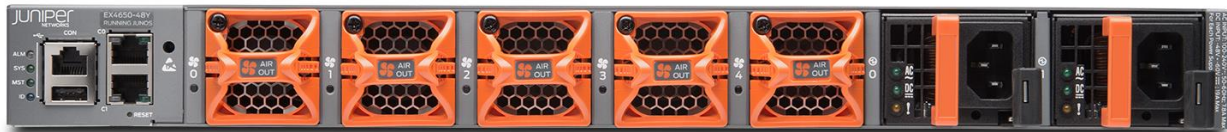
Figure 10 - EX4650-48Y rear view

The following table maps each logical interface type defined in the FIPS 140-2 standard to one or more physical interfaces.