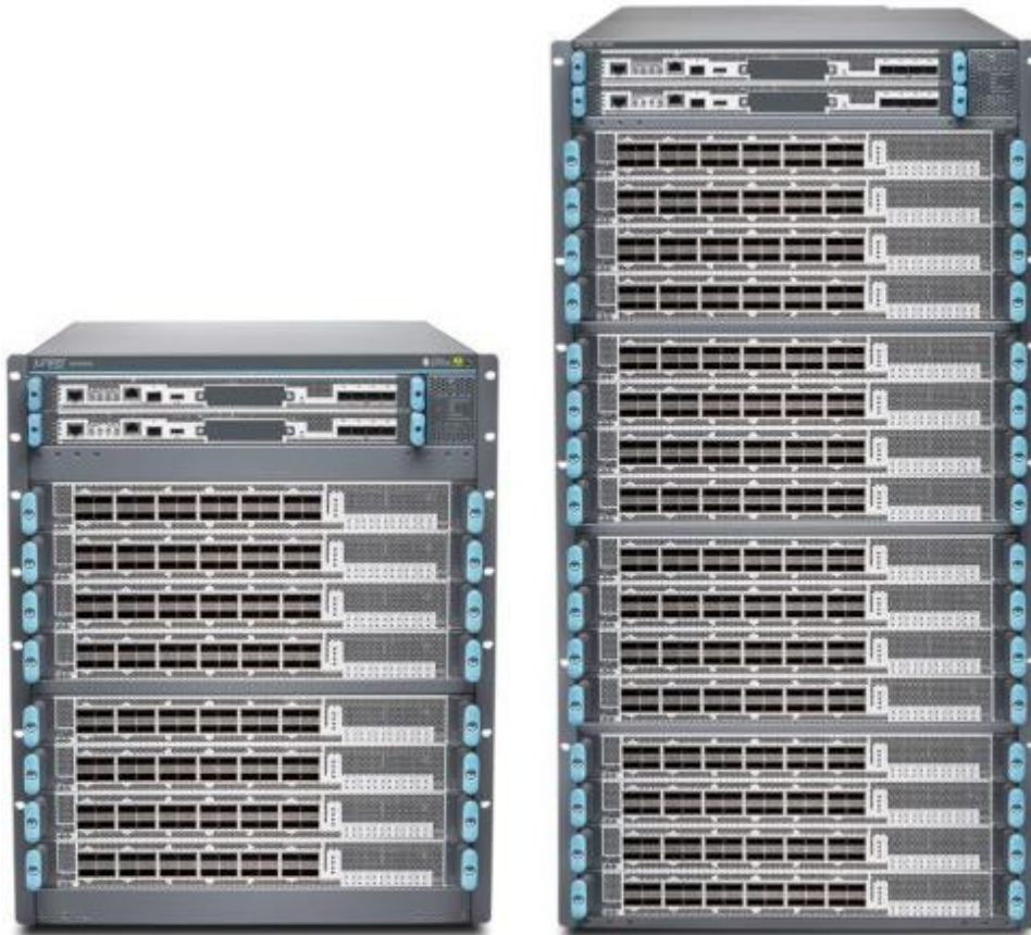
Figure 1 – Physical Cryptographic Boundary (Left to Right: PTX10008 and PTX10016)

The images below depict the physical boundary of the modules, including the Routing Engine, the PTX10K-LC1105-M MACsec Line Card and SIB. The boundary excludes the non-crypto-relevant line cards included in the figure. The modules exclude the power supplies from the requirements of FIPS 140-2. The power supplies do not contain any security relevant components and cannot affect the security of the module.