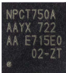
Figure 1. LAG019 in QFN32 Package