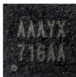
Figure 2. LAG019 in UQFN16 Package