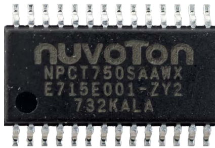
Figure 3. LAG019 in TSSOP28 Package

The physical cryptographic boundary of the Module is the outer boundary of the chip packaging.